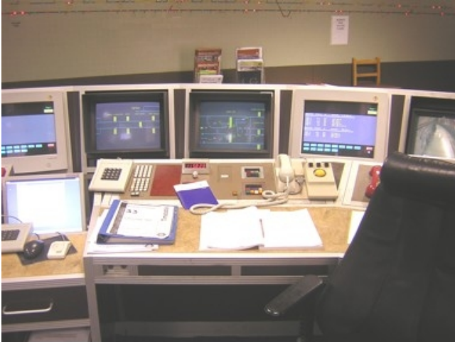
Figure 2: a controller's desk

The timetable is programmed into the system and also available as a file of paper printouts, placed in plastic envelopes so that alterations can be marked on them in chinagraph pencil (Figure 3). These marks indicate where a train is to be withdrawn or switched to take the place of another train. Using solutions such as these, the controller attempts to keep the service running to the expected programmed schedule with a minimum of intervention, as described in more detail below.